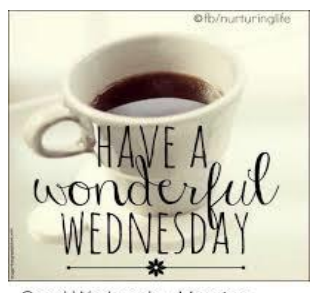
Good Wednesday Morning Coffee | Images

Infinite Café, Rosetta Road, Raumati Beach