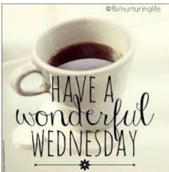
Good Wednesday Morning Coffee | Images