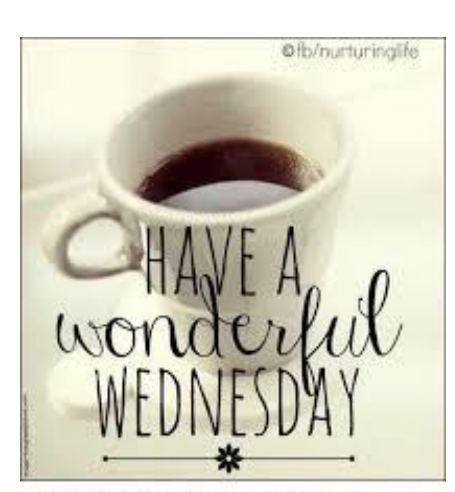
Good Wednesday Morning Coffee | Images

Coffee Morning – Wednesday, 15<sup>th</sup> November