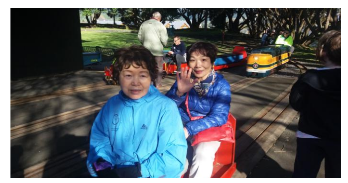
Riding the trains at Raumati Beach Park

These photos were taken in 2018 – a great group from Japan - we had so much fun.