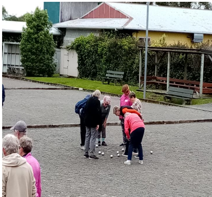
Checking to see who has won the game.

The visit was so successful, we have decided to join up with Wellington to host them up here at our Pentanque Club. No date has been set yet, however, as soon as we have one, we will let you all know.