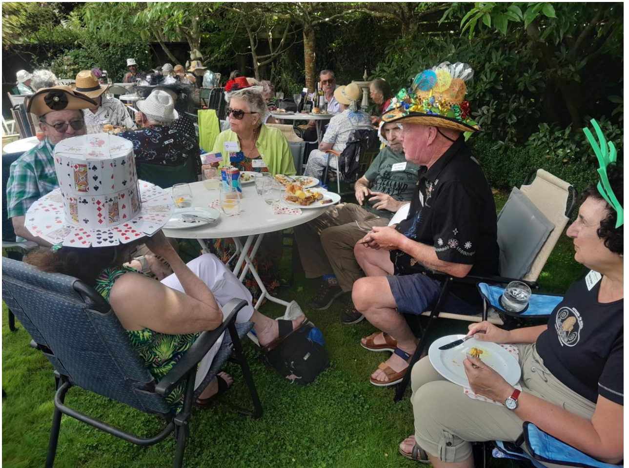
There were some wonderfully creative hats on display, especially amongst our American visitors!