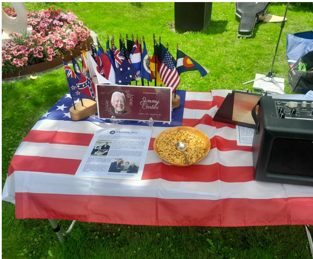
Our tribute to former President Jimmy Carter included a bowl of peanuts!