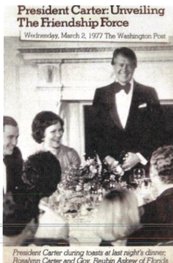
President Carter: Unveiling The Friendship Force Wednesday, March 2, 1977 The Washington Post

Friendship Force honors the memory of the late President Jimmy Carter with deep gratitude and fondness. A Nobel Peace Prize laureate, President Carter passed away on December 29th at his home in Plains, Georgia. Nearly 50 years ago, his pivotal role in founding Friendship Force helped shape an enduring legacy of global connection and peace.