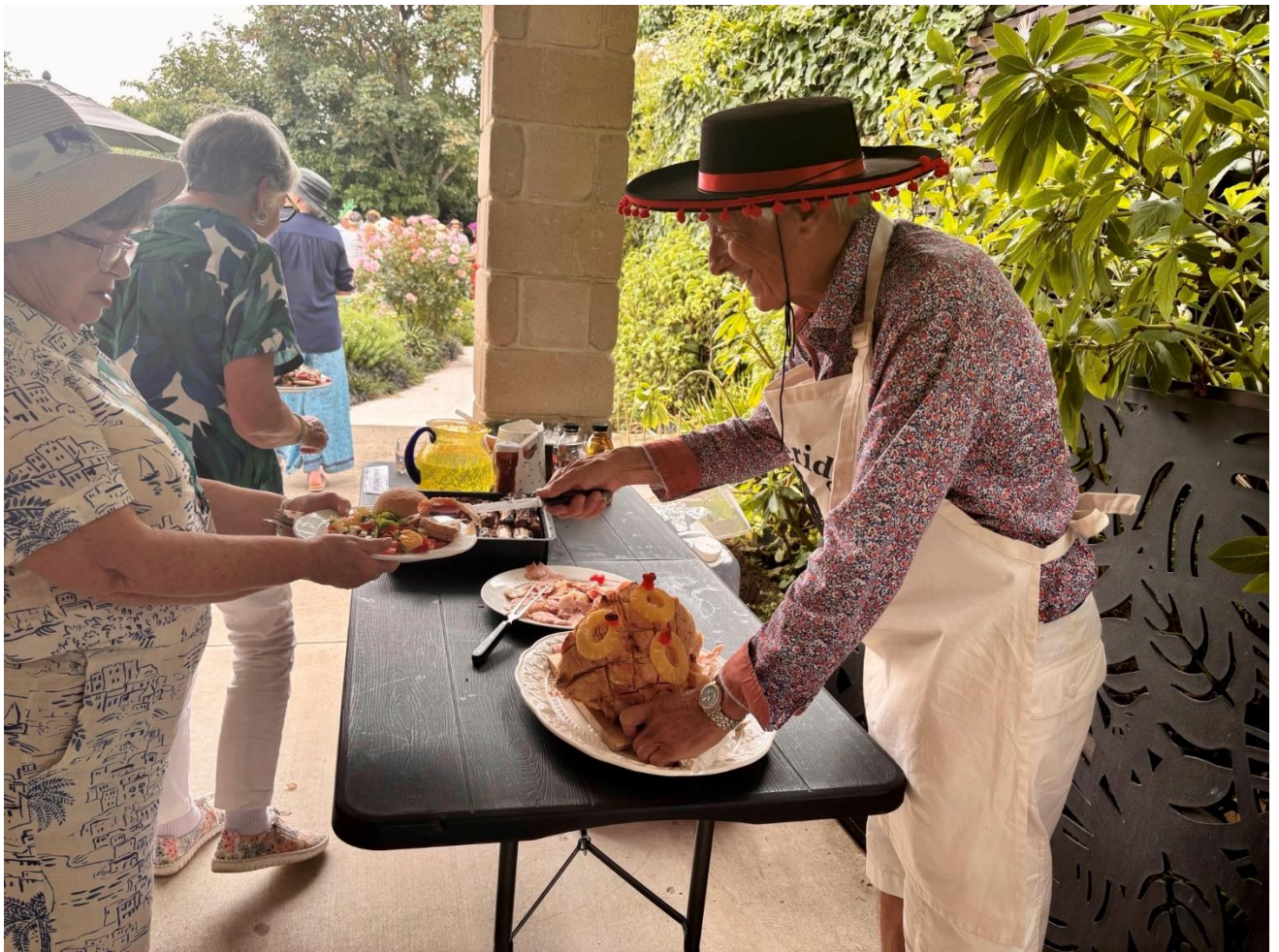
As always the food was plentiful and went down a treat, especially the delicious ham provided by Wellington FF