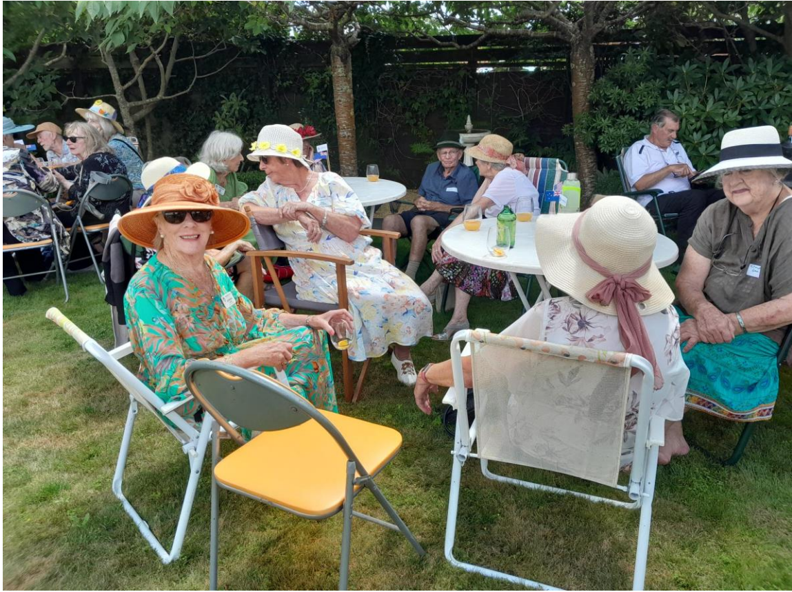
Members and guests enjoying the occasion and each other's company