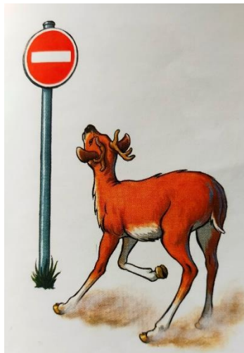
The buck stops here