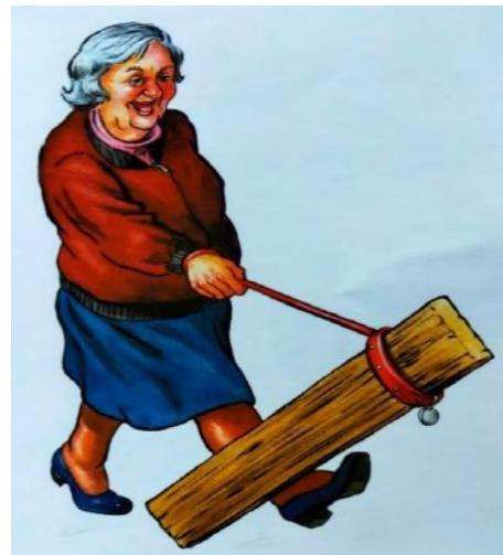
Walking the plank