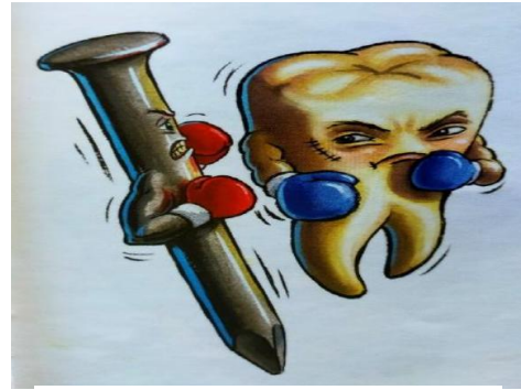
Fight tooth and nail