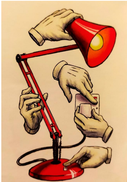
Many hands make light work