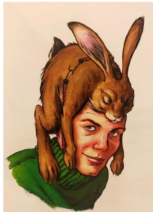
Keep your hare (hair) on